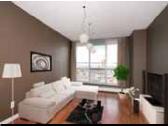
Oliver $169,900 Unit1103-12121-JasperAve.com