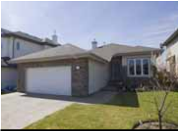
Suder Greens $600,000 www.20723-89ave.com