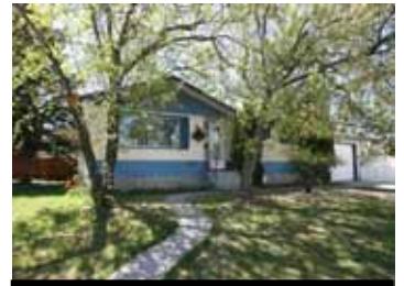
Evansdale $285,000 www.8303-147ave.com