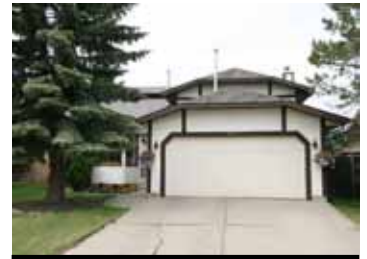
Carlisle $369,900 www.12260-144ave.com