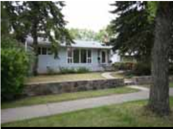
Inglewood $299,999 www.11731-125street.com