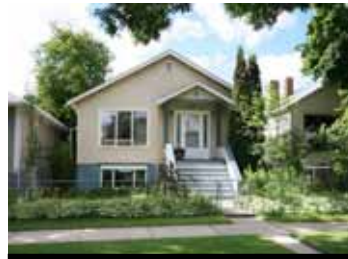
Ritchie $359,000 www.9807-78ave.com