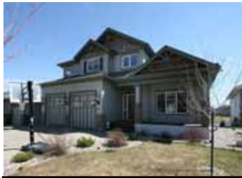
Windrose $675,000 www.3-WaltersPlace-Leduc.com