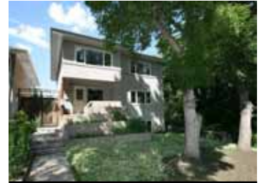
Rutherford $649,899 www.1919-125street-SW.com