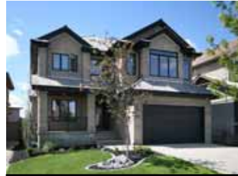
MacTaggart Area $799,999 www.4015-MactaggartDrive.com