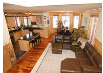
King Edward Park $899,000 www.9123-77ave.com