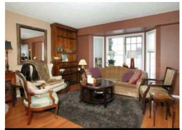
Bisset $270,000 www.40-2911-36street.com