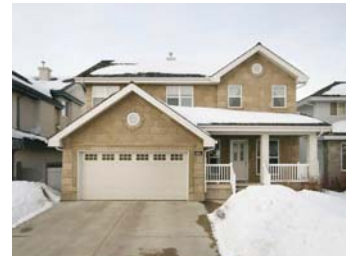
Donsdale $525,000 www.661-DalhousieCres.com