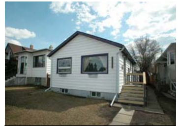
Queen Alexandra $309,900 www.10721-73ave.com