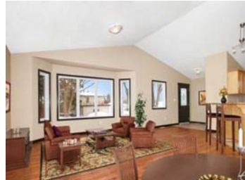
Delton $399,900 www.12306-93street.com