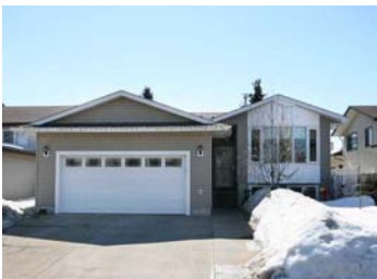
Bisset $360,000 www.3607-25ave.com