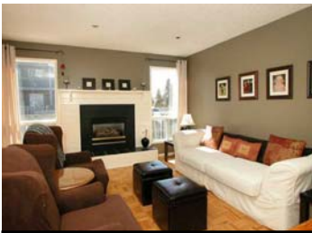
Pollard Meadows $224,900 www.31-4610-17ave.com