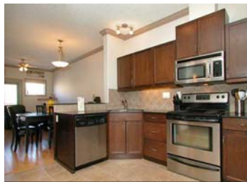
CPR Irvine $279,900 Unit315-10121-80Ave.com