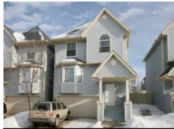
Jackson Heights $269,900 www.131-1670-JamhaRd.com