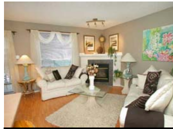
Baranow $269,900 www.40-15215-126street.com