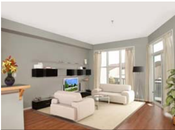
Empire Park $274,900 Unit245-4827-104A-Street.com