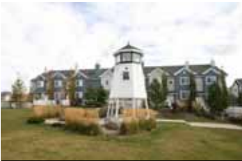
Summerside $279,900 www.Unit5-8304-11Ave.com