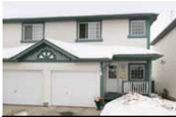
Baranow $275,000 www.40-15215-126street.com