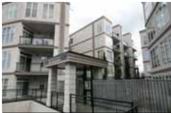
Empire Park $275,000 www.Unit400-4835-104A-Street.com