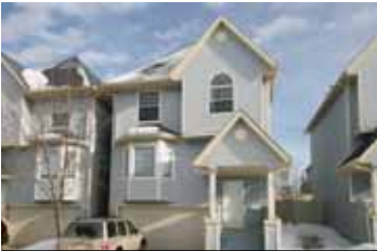
Jackson Heights $274,900 www.131-1670-JamhaRd.com

View these properties' individual websites! WeSellEdmonton.com