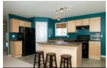
St. Albert $299,000 62-133-EastgateWay-StAlbert.com