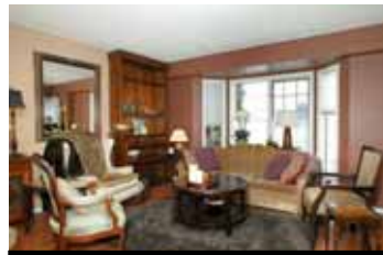
Bisset $270,000 www.40-2911-36street.com

View these properties' individual websites! WeSellEdmonton.com