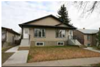
Calder $289,900 www.12741-116street.com