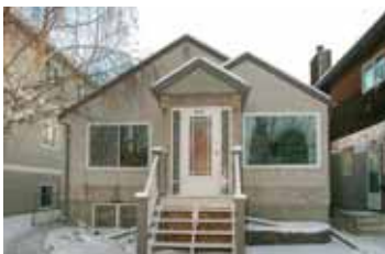
Strathcona $389,900 www.9937-85ave.com