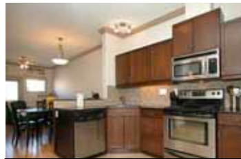
CPR Irvine $287,500 www.Unit315-10121-80Ave.com