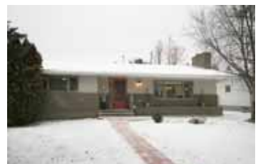
Parkview $699,900 www.8811-141street.com