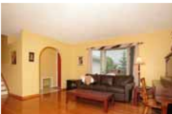
Duggan $374,900 www.4012-105B-Street.com