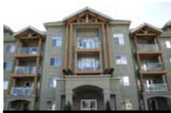
Suder Greens $199,999 Unit139-278-SuderGreensDrive.com