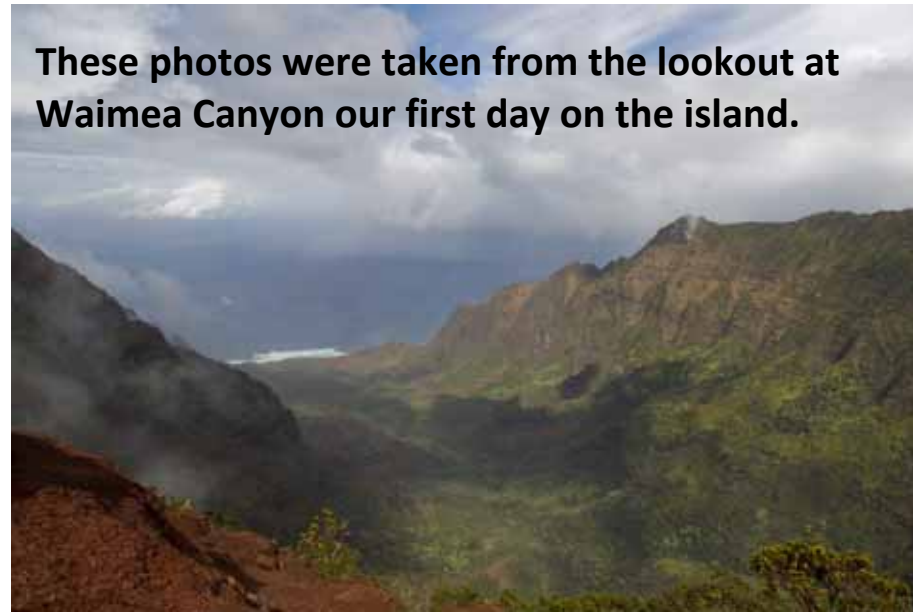
These photos were taken from the lookout at Waimea Canyon our first day on the island.

island...well it's usually sunny but we experienced unusually cloudy and rainy days. Now we know why it's so green! We didn't mind though, the rain felt more like stepping into a warm shower, and at least we didn't bring home sunburns! We stayed in a wonderful B & B in the sleepy town of Kekaha, a world away from any resorts or