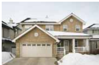
Donsdale $525,000 www.661-DalhousieCres.com