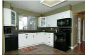
Kensington $275,000 www.13515-123A-Street.com