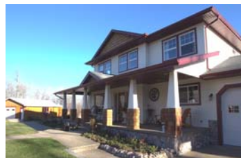
Strathcona $869,900 51063-RR203-SherwoodPark.com

Find out what your home is worth! WeSellEdmonton.com