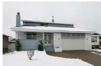
Baturyn $374,900 www.17221-111Astreet.com