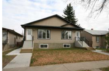
Calder $282,900 www.12741-116street.com