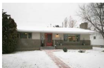
Parkview $735,000 www.8811-141street.com

View these properties' individual websites! WeSellEdmonton.com