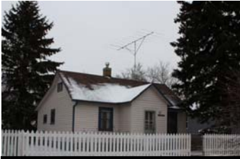
Rylie $60,000 www.5411-50st-Rylie.com