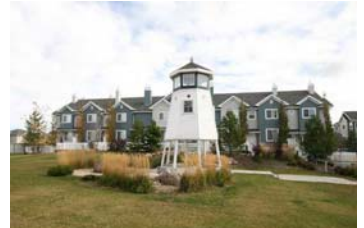
Summerside $289,900 www.Unit5-8304-11Ave.com