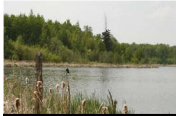
Parkland County $129,000 www.20-53102-RR31.com