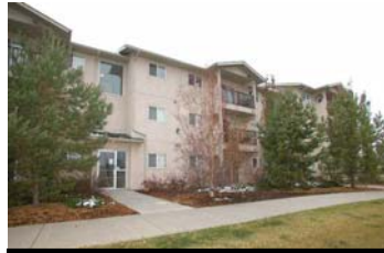
Athlone $130,000 www.Unit102-12710-127street.com

See NEW LISTINGS daily on our site! WeSellEdmonton.com