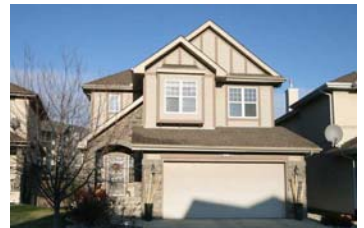
Hodgson $574,900 www.145-HaywardCr.com

View these properties' individual websites! WeSellEdmonton.com