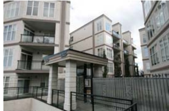
Empire Park $275,000 www.Unit40-4835-104A-Street.com