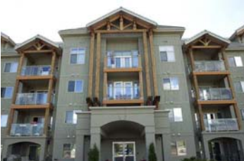
Suder Greens $199,999 Unit139-278-SuderGreensDrive.com.com

See NEW LISTINGS daily on our site! WeSellEdmonton.com