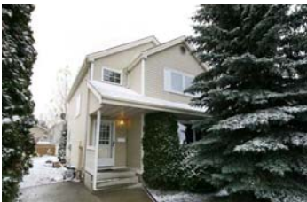
Village on the Lake $329,000 293-VantageLane-SherwoodPark.com