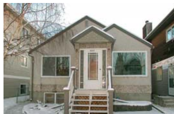
Strathcona $398,000 www.9937-85ave.com