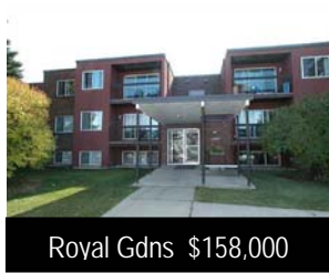
Royal Gdns $158,000