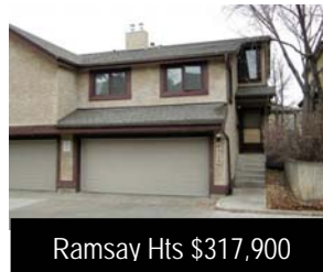
Ramsay Hts $317,900