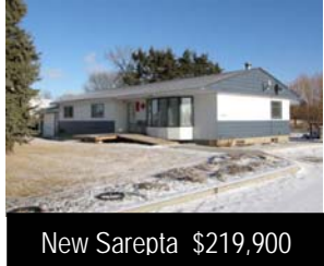
New Sarepta $219,900