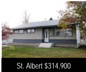
St. Albert $314,900