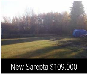
New Sarepta $109,000