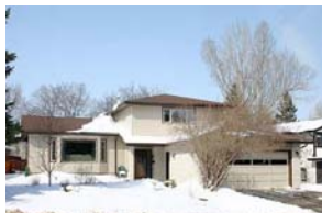
Brander Gdns $524,999