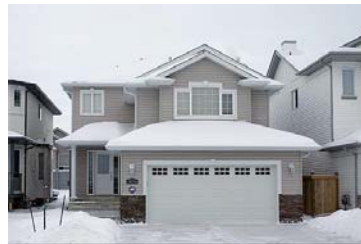
Chambery Sold in 91 days!