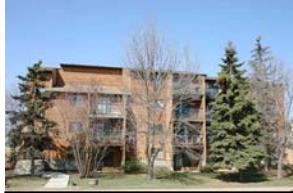
Prince Rupert $194,900