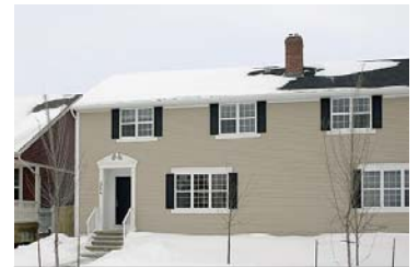
Griesbach Sold in 55 days!