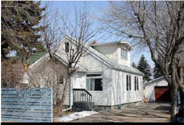
Grovenor Sold in just 7 days!