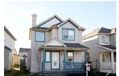
Terwillegar South Sold in 92 days!

"I would like to say thank you to Schmidt Realty Group for all their hard work in selling my home. I felt that they were always one step ahead of the game from day one and because of this the whole process went very smoothly from start to finish. They had me feeling very confident and prepared when receiving my first offer. I felt that the whole experience was made to be very stress free."