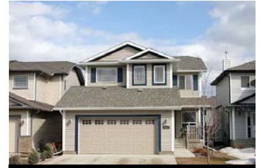
The Hamptons Sold in just 19 days!