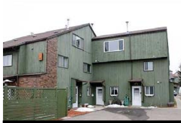
West Meadowlark Park Sold in just 11 days!