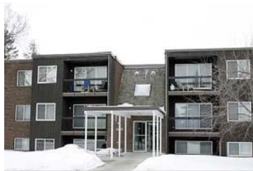
Royal Gardens Sold in 34 days!