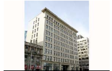
Downtown Sold in just 28 days!