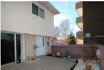
Royal Gardens Sold in 56 days!