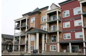
Terwillegar Towne $274,900