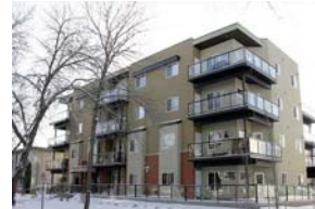
Queen Alexandra $389,900