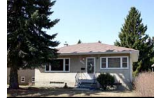
Queen Mary Park $299,900