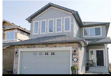
Terwillegar South Sold in just 19 days!