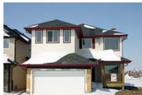
Terwillegar South $549,900