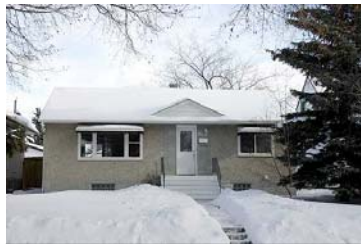
Dovercourt Sold in 63 days!