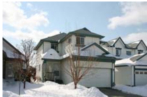
Breckenridge Grns $439,000