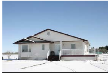
Devon Sold in just 26 days!