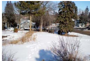
St. Albert (Empty lot) Sold in 43 days!