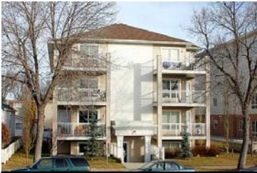
Queen Alexandra Sold in just 19 days!