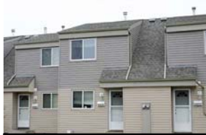
Brander Gdns $269,900