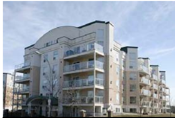
Ritchie Sold in just 20 days!