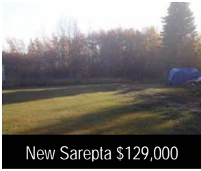
New Sarepta $129,000