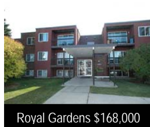
Royal Gardens $168,000