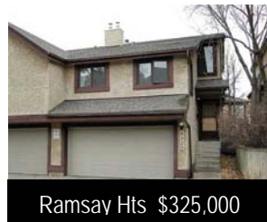
Ramsay Hts $325,000