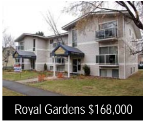
Royal Gardens $168,000